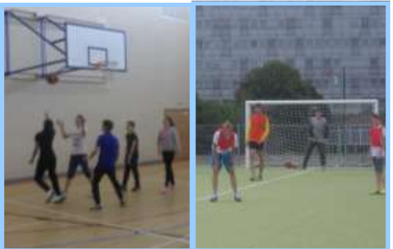
Sports - Brickfields