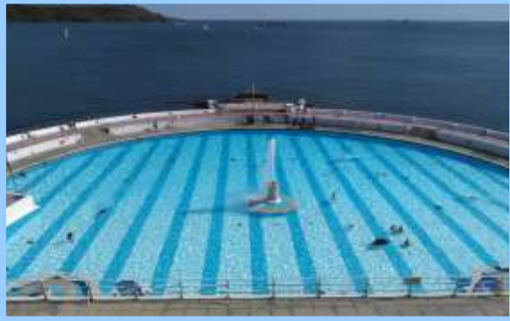
Swimming - Tinside Pool