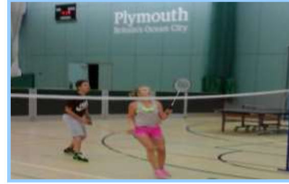
Sports - Life Centre