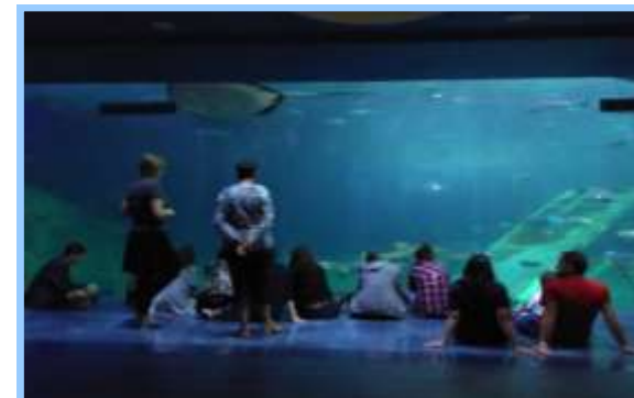
National Marine Aquarium

'I learnt a lot and my English has got better.'