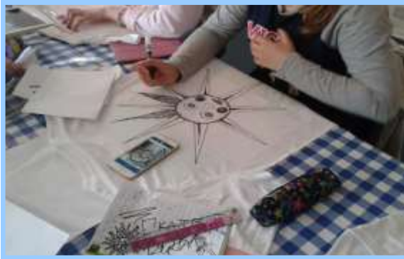
Art & Craft Workshop