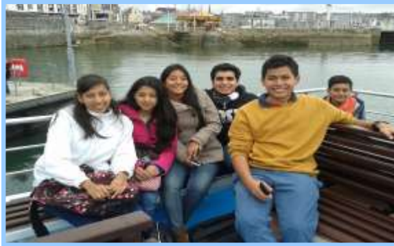
Boat trips (Dockyard & Warships)