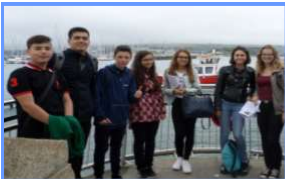
Induction & tour

Please check your Junior activity programme every day to see what activity you will be doing and what time you need to meet