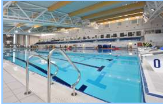
Swimming - Life Centre