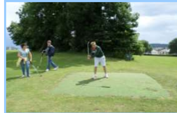
Pitch & Putt Golf