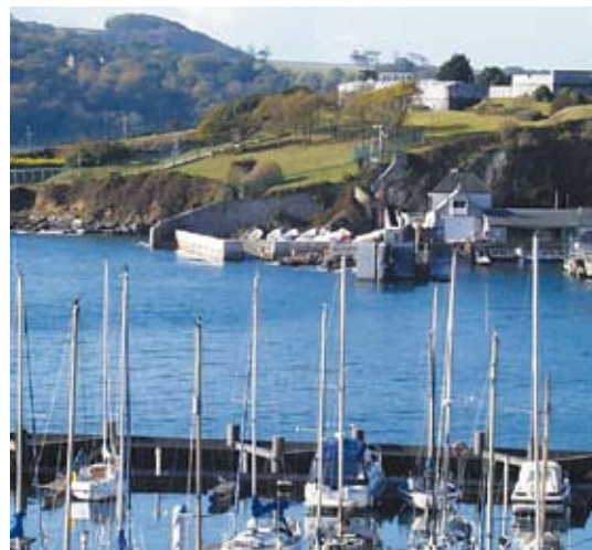
View of the harbour from the Mayflower College roof terrace

The timetable for a typical day of 5 hours tuition would be lessons from 09:30 to 11:10, 11:30 to 12:30 and 14:00 to 16:00.